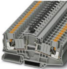
Component terminal block, Connection method: Push-in connection, Cross section: 0.5 mm 2 -10 mm 2 , AWG: 20 - 10, Width: 8.2 mm, Color: gray

Please be informed that the data shown in this PDF Document is generated from our Online Catalog. Please find the complete data in the user's documentation. Our General Terms of Use for Downloads are valid ( http://download.phoenixcontact.com )